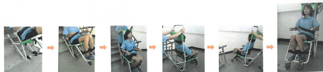
Turn by Four-Wheel